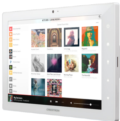
TSW-1060-W-S – Shown in White