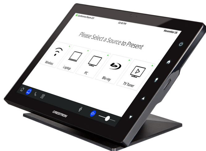
TSW-1060-B-S with TSW-1060-TTK-B-S Tabletop Kit

High-performance streaming video capability makes it possible to view security cameras and other video sources right on the touch screen. Native support for H.264 and MJPEG formats allows the TSW-1060 to display live streaming video from an IP camera, a streaming encoder (Crestron CEN-NVS200 , DM-TXRX-100-STR , or similar [3] ), or a DigitalMedia™ switcher . Video is delivered to the touch screen over Ethernet, eliminating the need for any extra video wiring.